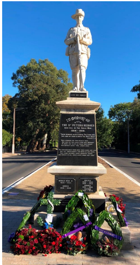
St. Peters Heroes Memorial