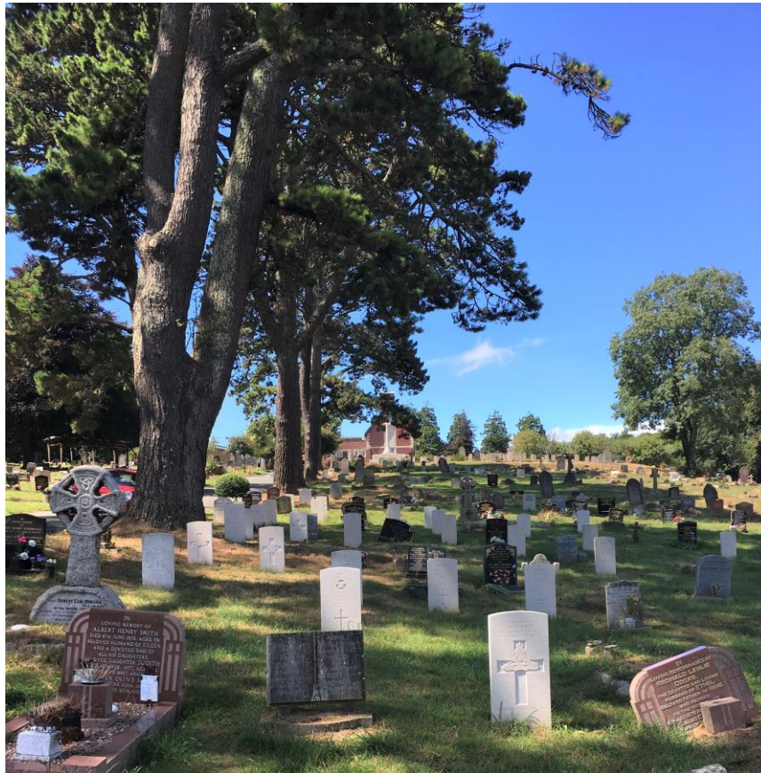
War Graves in Efford Cemetery, Plymouth