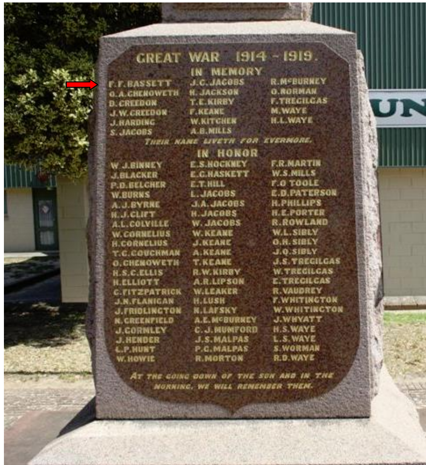
Willunga War Memorial