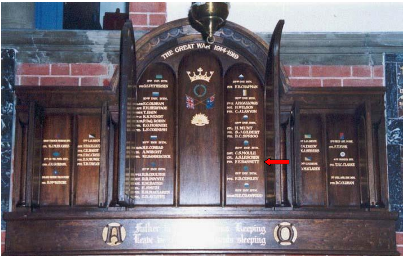
All Souls Anglican Church Honour Board