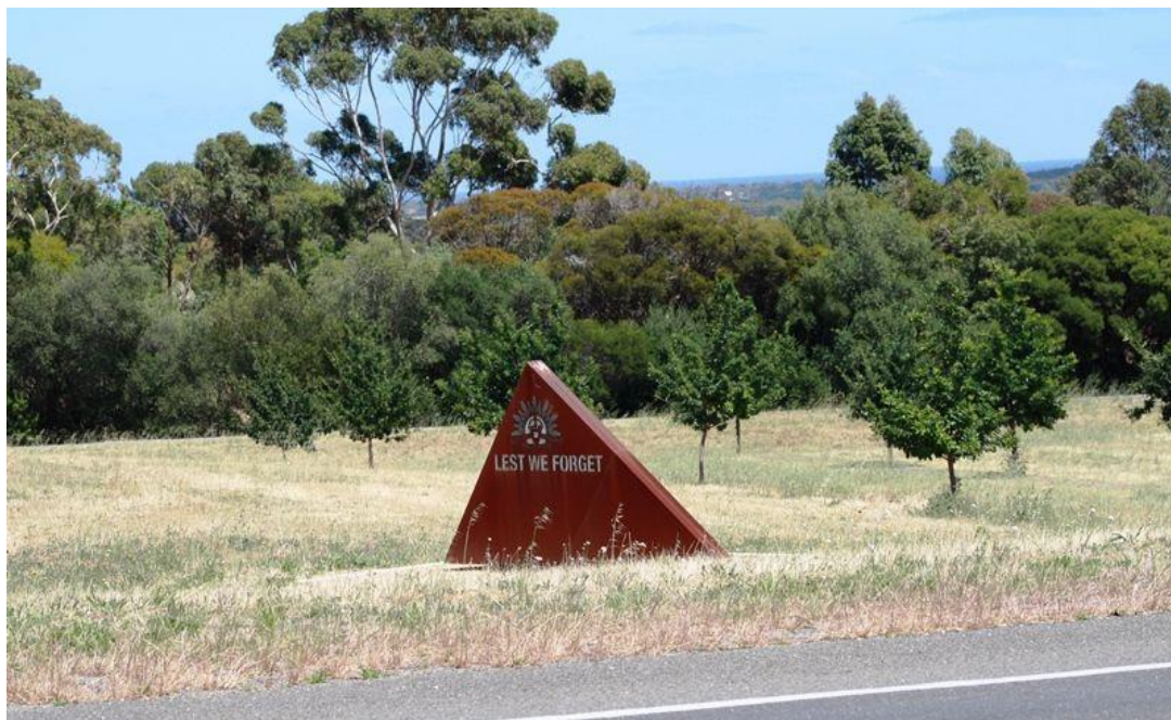
Willunga Avenue of Honour

Private F. F. Bassett is remembered with a tree on the Willunga Avenue of Honour. 100 trees were planted to commemorate the 100th anniversary of the Gallipoli Landing. The trees can be found on Victor Harbour Road & Aldinga Road, Willunga, South Australia. Pte Bassett is remembered with a cypress tree between Hill Street & Main Road, Willunga, near the Alma Hotel.